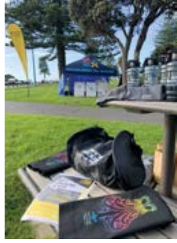
Some of the spot prizes provided by Hāpainga (Stop Smoking Service)