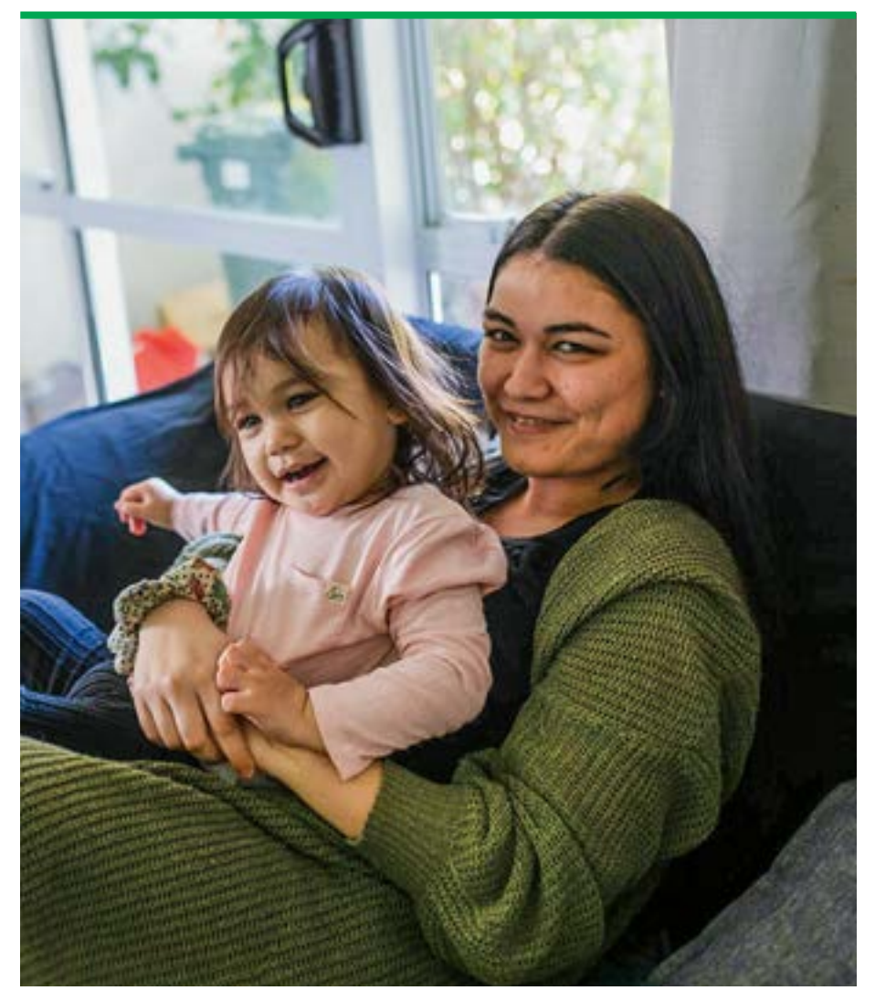
The new partnership is seeing an increase in whānau using the service, an increase in GP registrations, and increased confidence in the health system.